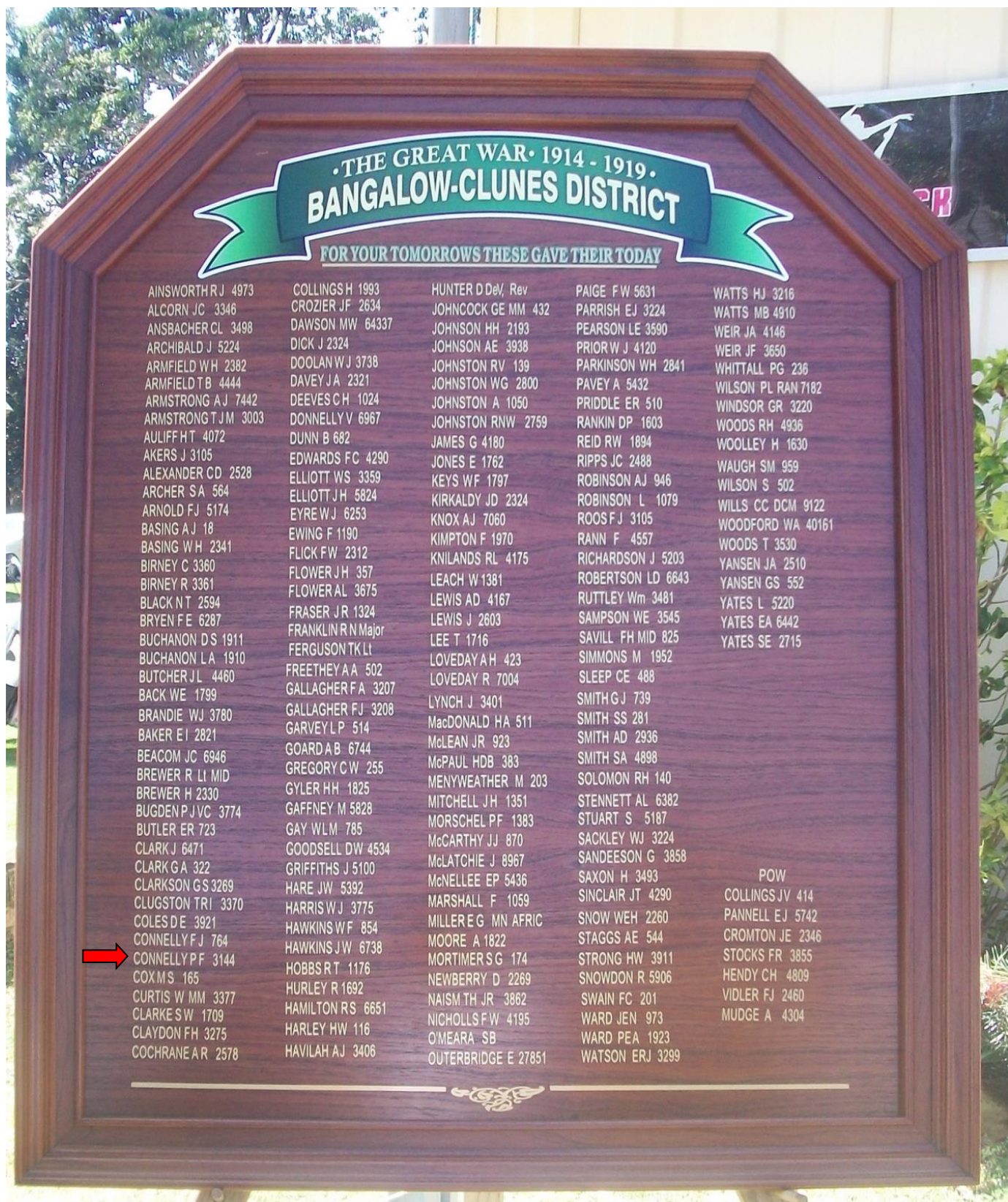
Bangalow-Clunes Great War Honour Roll