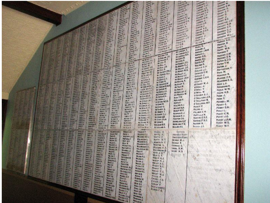
Mackay Old Town Hall Honour Board