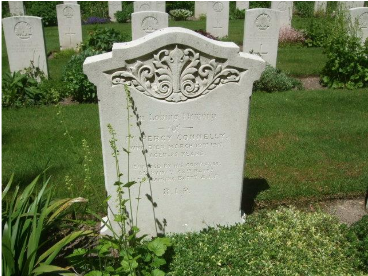
A Headstone for Private Percy Connelly is located in Main Front Row (Right Hand Side) Grave Plot # 12 of Codford War Graves Cemetery (CWGC Reference - Grave # 82)